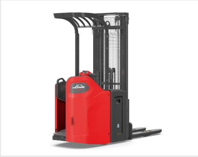
Operator remains safe within the chassis contours