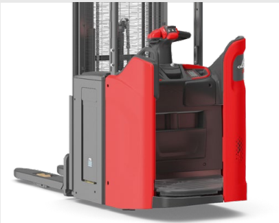
Ergonomic, height-adjustable tiller