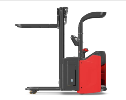
Precise handling and easy manoeuvrability