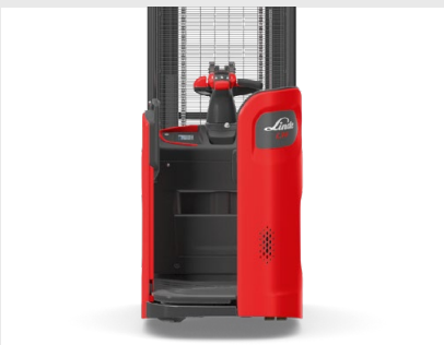
Easy access to all data with multi-function display